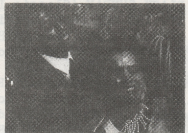
ANOTHER ARGENTO SET PIECE FOR 'OPERA'. PAGE 15,16,17+18