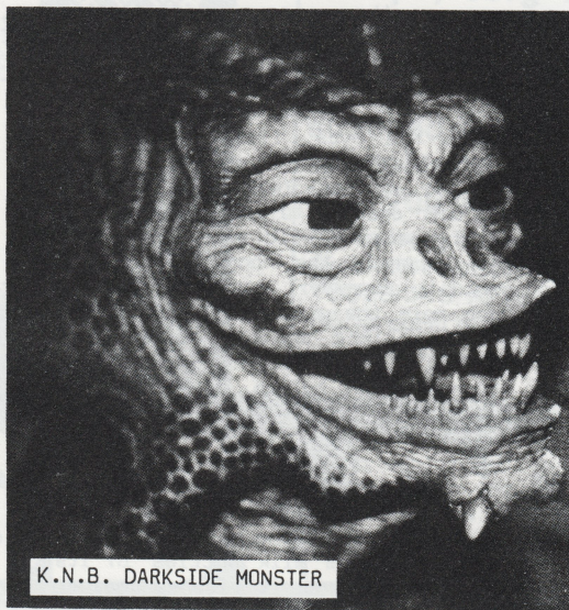
K.N.B. DARKSIDE MONSTER

A: Yes. You figure with "Fangoria" that the movies are going to be pretty gruelling and not pulling punches because that magazine always talks about uncensored films and all that stuff, but the films they ended