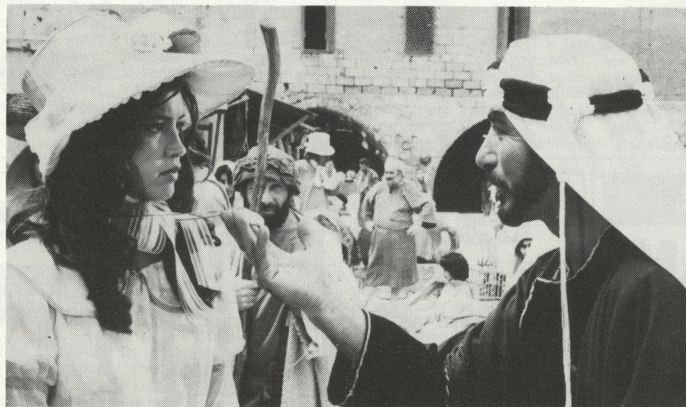
● Phoebe Cates in a scene from "Paradise" (Embassy Pictures).