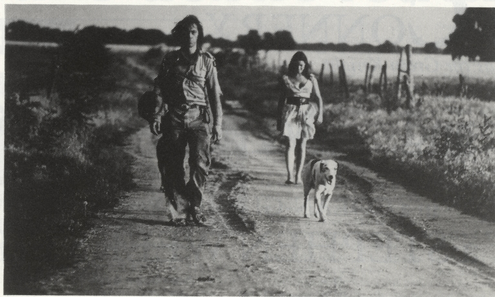
● David Carradine and Barbara Hershey in "Americana".

We list the movie's name, the day, time of screening and theatre. (Times are 9 am, 11 am, 1 pm and 3 pm.)