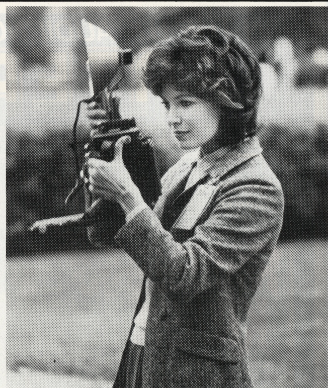
● Jaclyn Smith as Jackie Kennedy.

To emphasize the importance of the film, the entire executive staff of ABC Pictures International will be