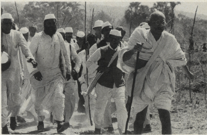
● Ben Kingsley in “Gandhi”

Edinburgh Film House with £4,624 net, while in Glasgow, First Blood entered its seventh week with a strong £1,988. This latter film took a good £1,662 in Brighton. The Beastmaster registered a good £4,838 for Sheffield’s Gaumont 2. Bronx Warriors enjoyed a steady week in Nottingham with £2,121 tucked under its belt, The Plague Dogs went down well in Newcastle with £1,167 at the Odeon 2 and Heat And Dust has held on well in its