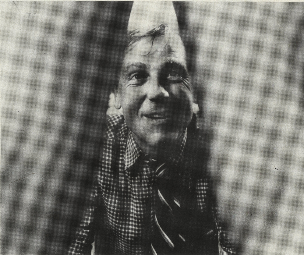
● "The Clinic" — opening for the Australian Film Commission

Naturally, there will be some last minute changes, so you should check the final screening list that the AFM will print each day.