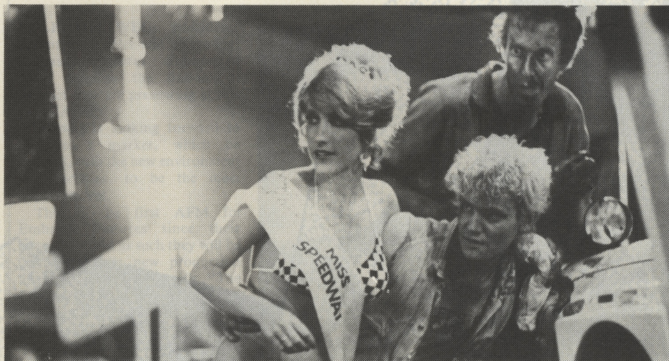
● Overseas Film Group's "Midnite Spares", screening at the market.