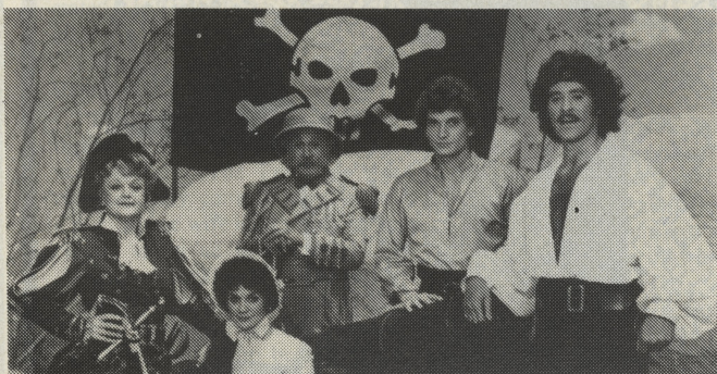
● "The Pirates Of Penzance".

Overseas Film Group will be based at the AFM in Suites 504-505-506.