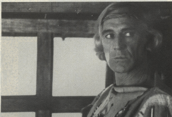
● Richard Harris in Hemdale's "Triumphs Of A Man Called Horse".