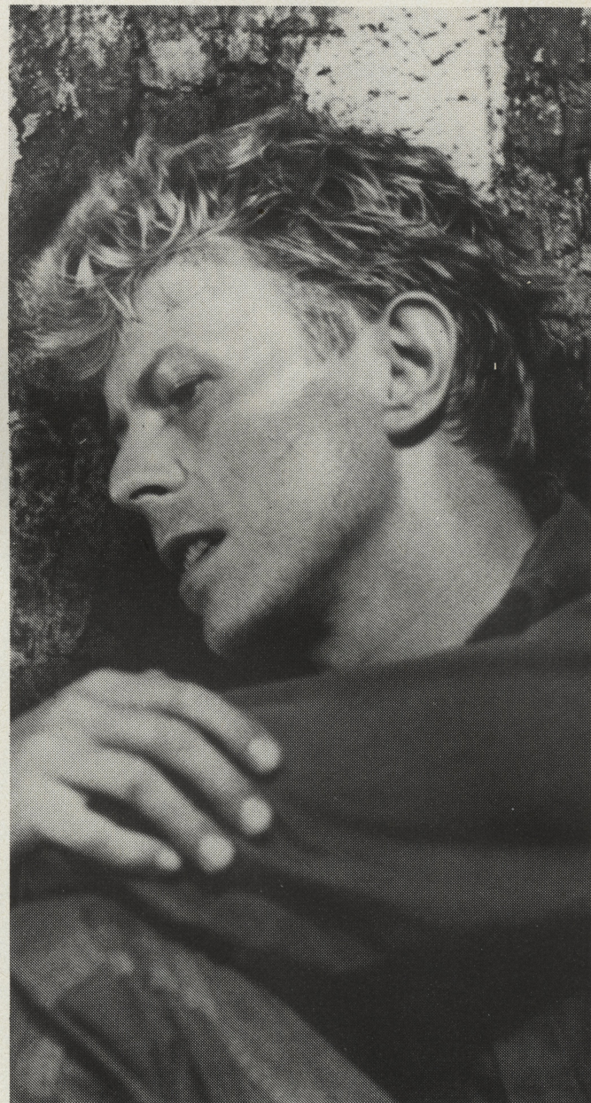
● David Bowie in "Merry Christmas, Mr Lawrence".

Palace will be seeking films of similar excellence for acquisition during the AFM.