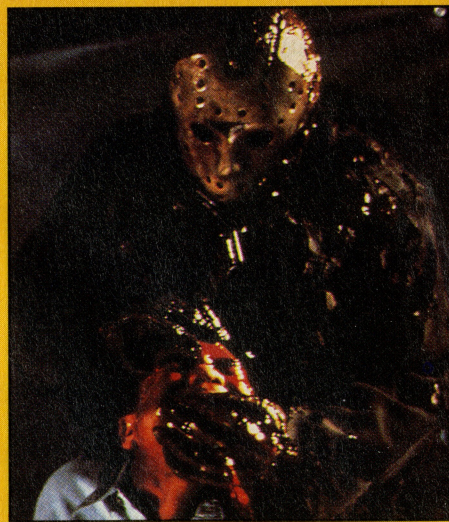
Friday The 13th