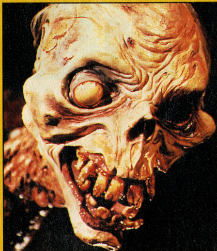
The Evil Dead

Not so much a sequel, more a black comedy re-make of the original, this hugely enjoyable movie plays like a bad dream running through the brain of Ash (Bruce Campbell), the sole survivor of the first picture. Here he gets tooled up with a shotgun and a chainsaw and prepares to kick some demon ass. Lots of laughs, some great gore (the flying eyeball is very tasty!) and a neat twist ending that paves the way for the long-awaited third in the series (which has just started filming in Texas). Not as